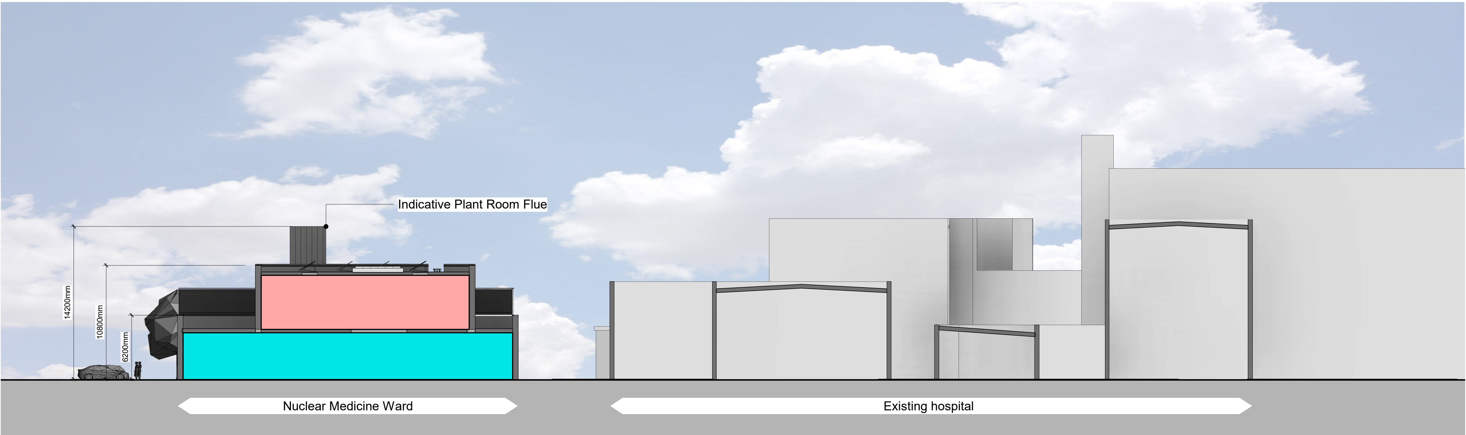
2 Illustrative Section B-B 1 : 200